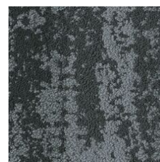
Calm 05580 LRV 9.4